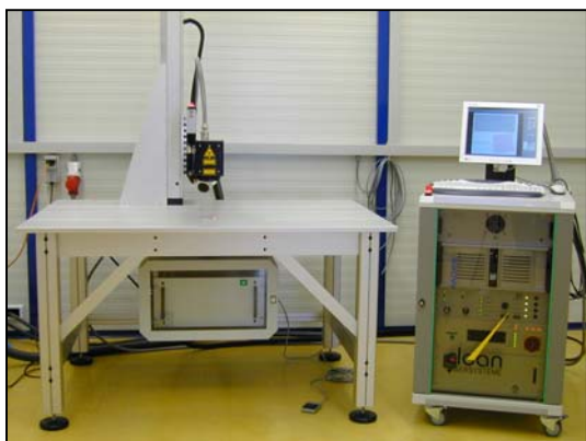
CL 150 WS with axis system (z-axis)