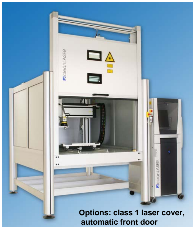
Options: class 1 laser cover, automatic front door